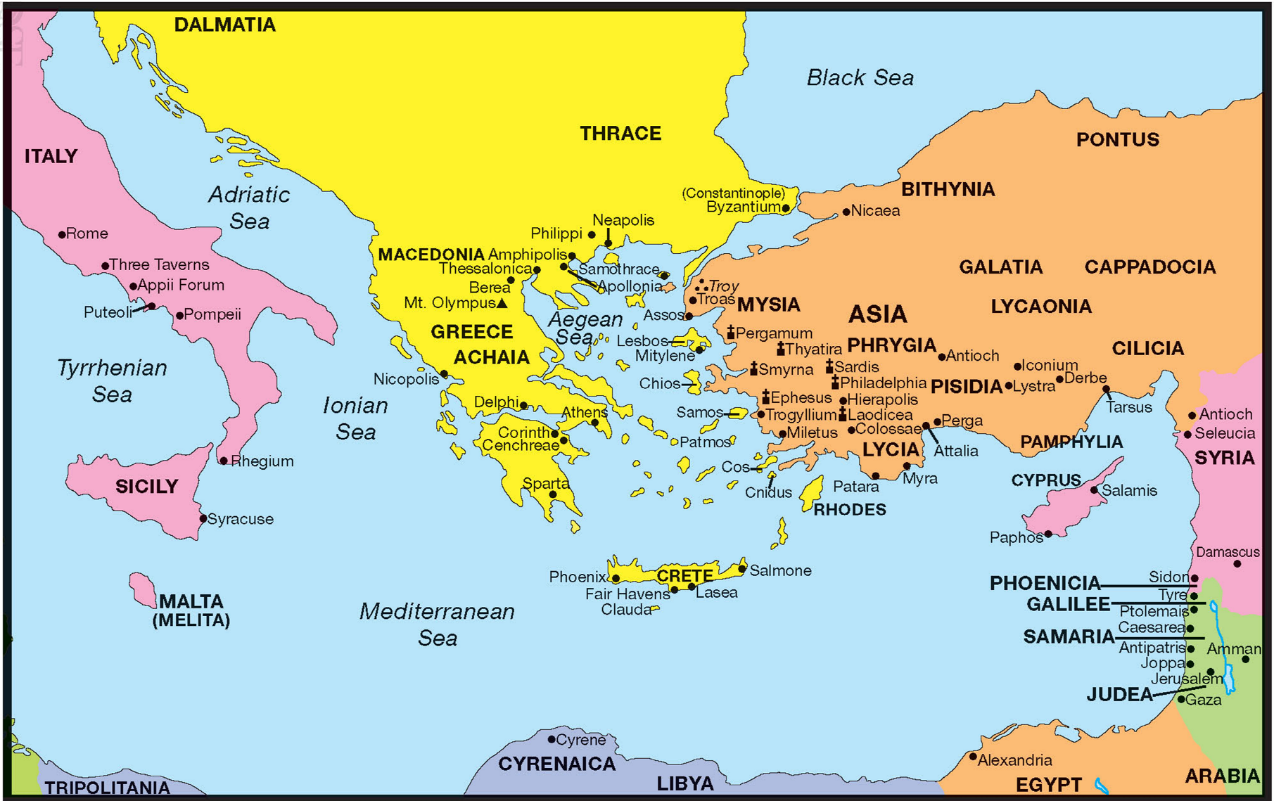
Ancient cities that exist