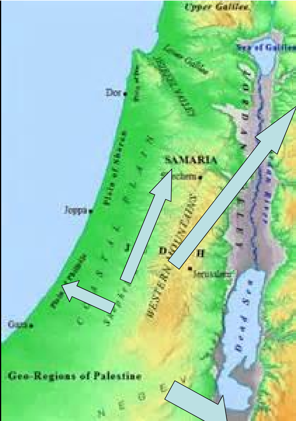
Geo-Regions of Palestine